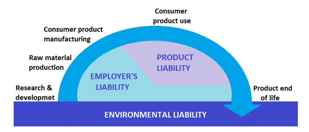
Figure 1. The life cycle of products containing nanomaterials and the type of insurance products that can be impacted

repair (e.g. manufacturers, wholesalers or retailers of products containing nano-applications) may incur liability to their customers and others for injury, illness, loss or damage arising from the supply of goods. Liability may arise under common law, under contract or under statute. In addition to employer liability and product liability losses, there can be losses arising out of environmental liability. There are numerous scenarios in which the environment can become contaminated at any stage of the nanotechnology life cycle. These include industrial accidents at the production and manufacturing stage, spillages, leakages and toxic waste accumulation in landfills. Products containing nanomaterials are becoming increasingly more available in areas like medicine, automotive, food, electronics and appliances. This means that professionals such as medical doctors and corporate directors and officers can become subject to some nanotechnology risks (e.g. professional liability can arise from wrong dosages or drug prescription).